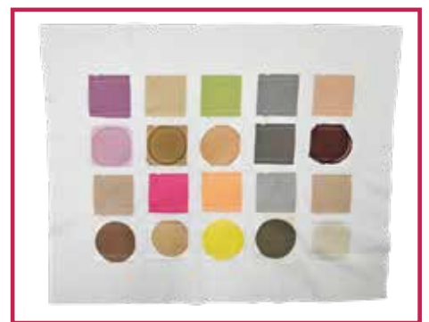
MON-AISE A+B Plus